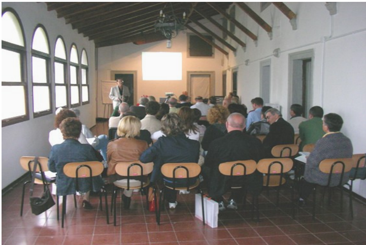
Main meeting room